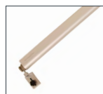
Easyclose Automatic Door Closer (SC100)