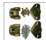
1 Door Fittings Kit (C1)

View our full range of door handles and flush pulls on pages 128 and 129.