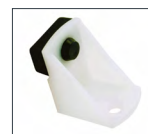
Door Stop (28P)